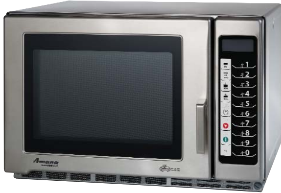
Model RFS12TS shown